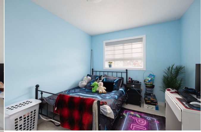
14-400 Sparrow Hawk Dr, Fort Mcmurray, AB