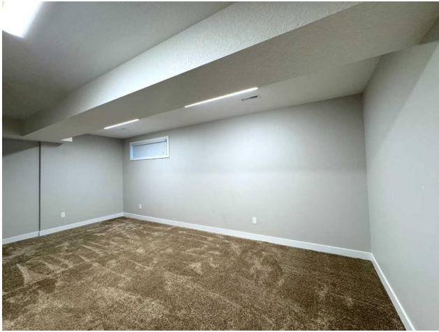
Basement (Below Grade) Exterior Area 516.12 sq ft Interior Area 465.41 sq ft