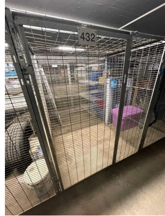
2614-135B Sandpiper Rd, Fort McMurray, AB

Main Floor Exterior Area 951.66 sq ft Interior Area 989.84 sq ft