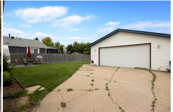
149 Kennedy Crescent, Fort McMurray, AB

Measurement Diagram for Detached Garage Exterior Wall Thickness: 4.5 in