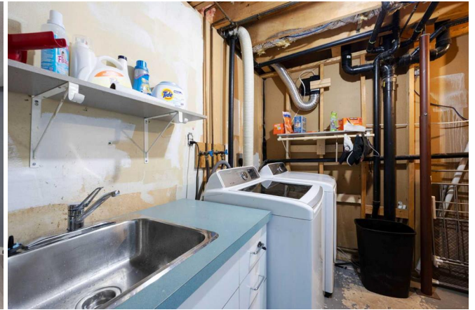
149 Kennedy Crescent, Fort McMurray, AB

Basement (Below Grade) Exterior Area 1202.78 sq ft Interior Area 1123.85 sq ft