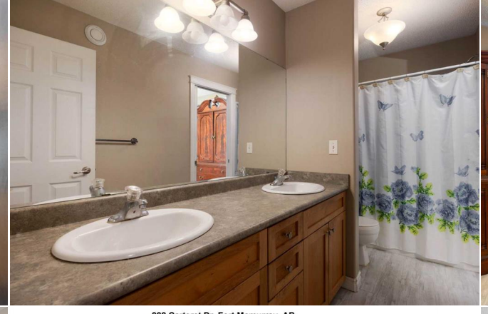
222 Carteret Dr, Fort Mcmurray, AB Mein Floor Editor Area 818.17 og ft Interior Area 730.84 og ft Exclude Area 280.68 og ft