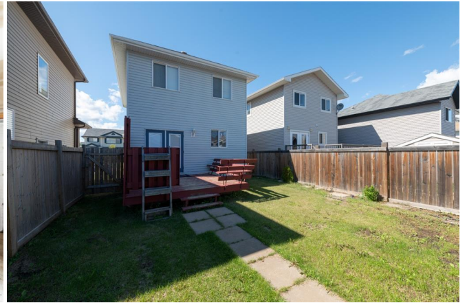
254 Thrush St, Fort McMurray, AB

Main Floor Exterior Area 706.17 sq ft Interior Area 647.55 sq ft