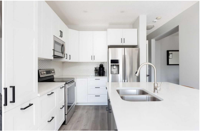
605 Walnut Crescent, Fort McMurray, AB

2nd Floor Exterior Area 673.91 sq ft Interior Area 805.46 sq ft Excluded Area 20.25 sq ft